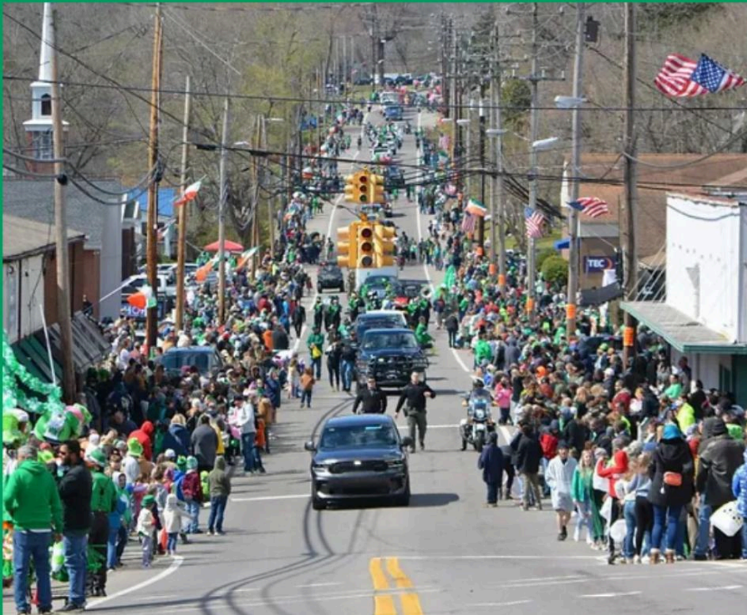
Houston County Area Chamber of Commerce

A meeting was held with members of the Houston County Area Chamber of Commerce at noon, November 14th in downtown Erin. Attendees and the consultant spoke about numerous items regarding the county, Tennessee Ridge and the City of Erin.